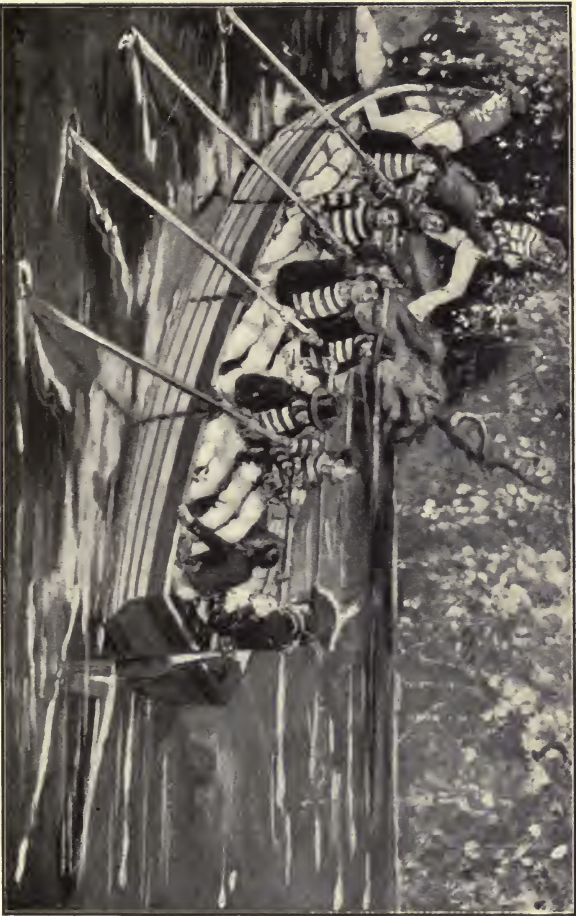
“BILL HAD SCRAMBLED ON SHORE AND DISAPPEARED”